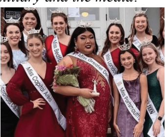
'Trans' Teen wins beauty pageant in NH

When people fear their government, there is tyranny. When the government fears the people, there is freedom. What made America great? Freedom! We are seeing the beginning of a tyrannical government just as others witnessed in communist countries. The Nazi Gestapo and KGB would come in the middle of the night and take