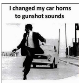
Now people move out of the way faster