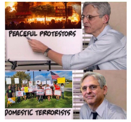
Attorney General Garland

Senators <u> Ted Cruz</u> and <u> Tom Cotton </u> angrily grilled Attorney General <u> Garland </u> during a Senate hearing-calling parents domestic terrorist liable for prosecution </u>